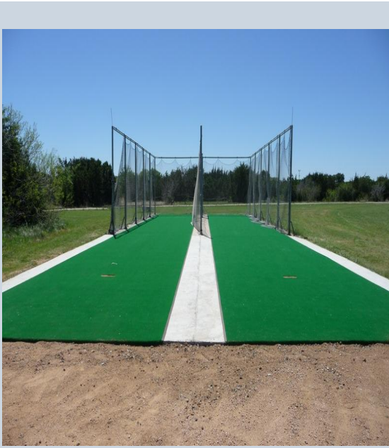
All improved practice area.

Enough was heard about the injuries and inconvenience caused to its members. One of the major tasks undertaken by BOD was to fix the practice area.